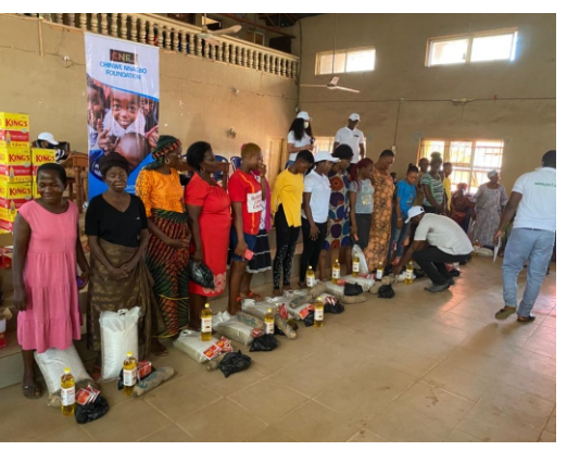
Picture of beneficiaries carrying their foodstuffs and an aged woman holding her foodstuffs